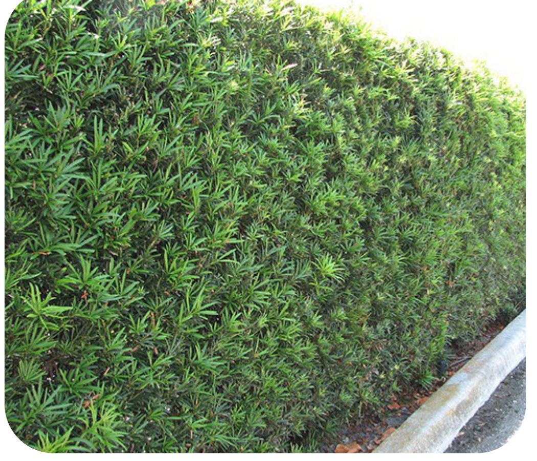
Landscape Hedge for screening