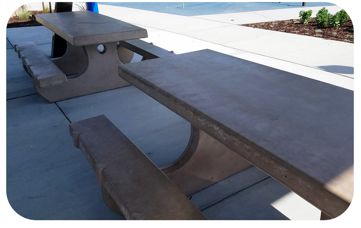
Shaded Gathering Space w/ Tables