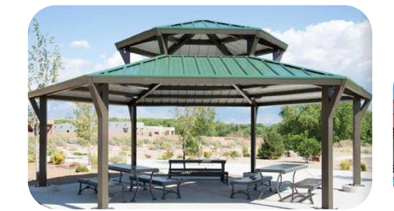
Shade Structure Element